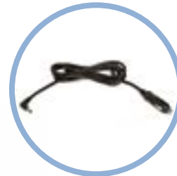
Inogen One ® G4 DC Power Cable* Item # BA-306