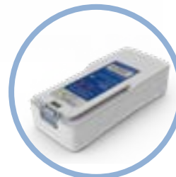
Inogen One ® G4 Extended Life Lithium Ion Battery** Up to 5 hours run time Item #BA-408