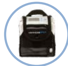
Inogen One ® G4 Carry Bag* Item # CA-400