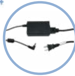
Inogen One ® AC Power Supply* Item # BA-401