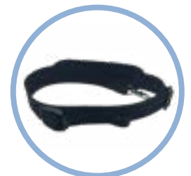
Inogen One ® G4 Carry Strap* Item # CA-401